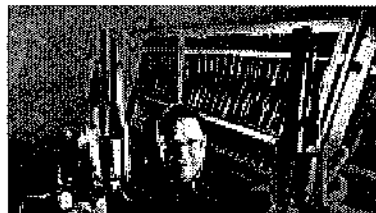
ON LOCATION: People and places behind what's onscreen